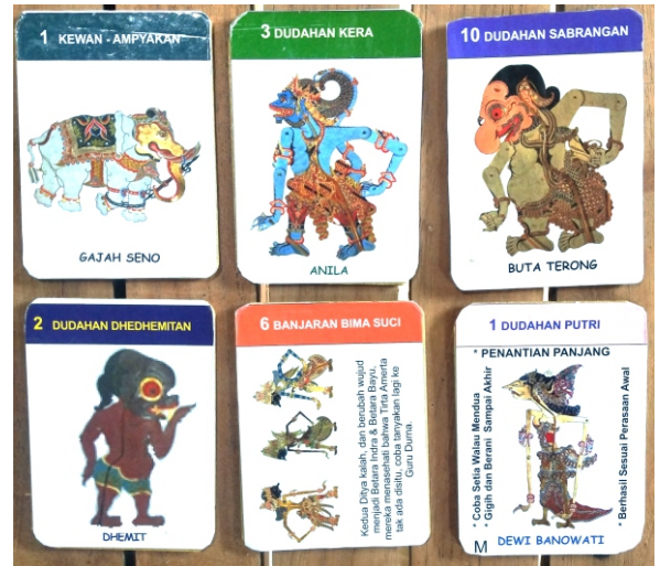
Wayang Tarot Cards, more than 340 figures